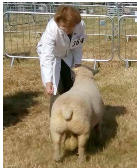
Holly Bar Question

Pedigree includes bloodlines: Camber Castle – Manor – Brant – Broadreed – Moulton