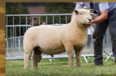
Chaileybrook 18/00297 Percheron x Chaileybrook 15/00010 Breed champion Tenbury Show 2019 Top price Worcester Premier Sale 2019