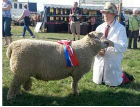
Holly Bar Leader

Pedigree includes bloodlines: Camber Castle – Manor – Brant – Broadreed – Moulton