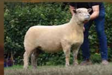
Chaileybrook 18/00308 Percheron x Chaileybrook 15/00010 Reserve interbreed champion Hanbury Show 2019 Breed champion Royal Bath and West and Hanbury shows 2019