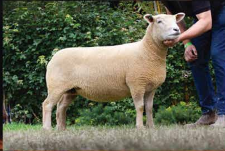
Chaileybrook 15/00010 Breed champion Royal Three Counties 2019 Female and reserve overall champion 125th anniversary National Show 2016 Breed champion Royal Bath and West and Royal Three Counties 2016