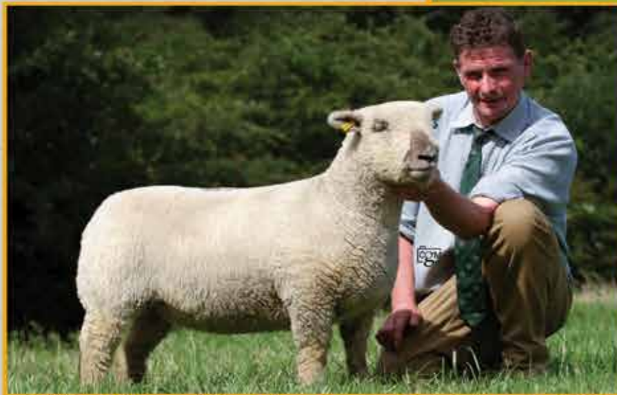
Sold for 600gns at Southdown Premier Sale, Worcester 2019