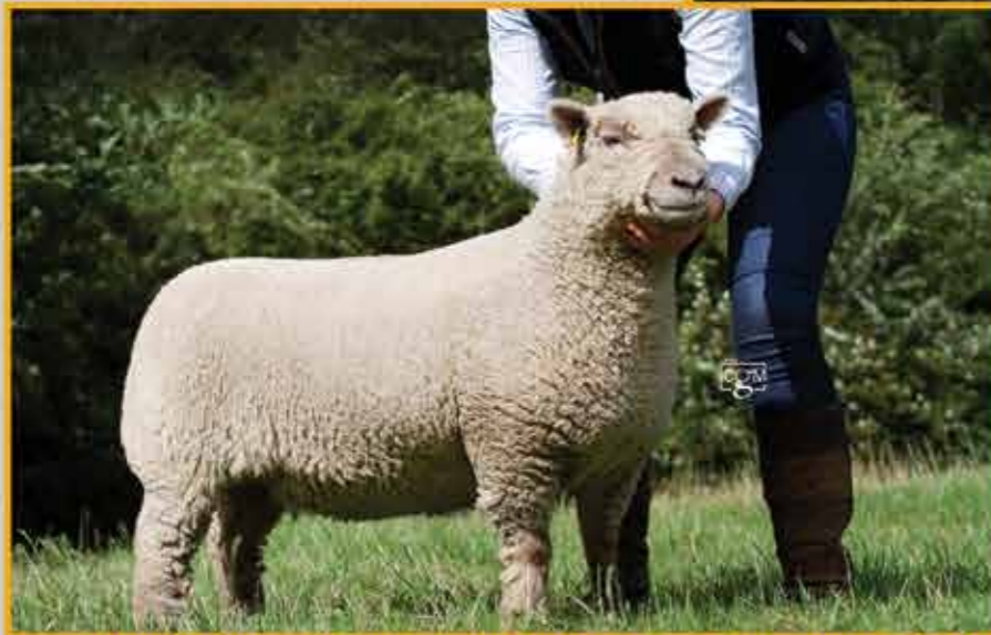
Sold for 760gns at Southdown Premier Sale, Worcester 2019